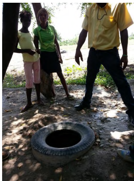
A "well" where villagers get water for their families