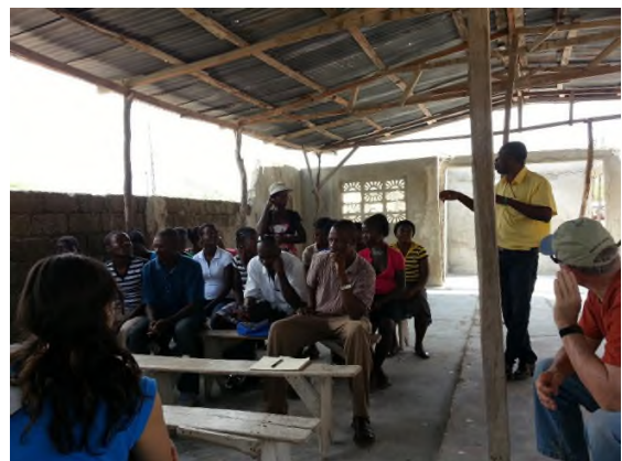
A training for villagers who have, or want to have, a water filter

have been stopped and robbed on several occasions, roads are, to put it mildly, lacking in infrastructure. There is precious little medical care once you are outside of a city. The language, Kreyòl, is difficult so translators and drivers are necessities. French is taught in the myriad of elementary "schools"...but