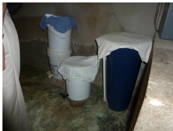
Filtration systems for individual families

They know what they can do with the resources they have and they do it well.