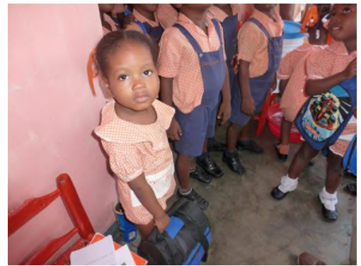
Haitian girl at school served by PWW

This is no easy task. To drive to a village 30 miles from Port au Prince may take 2½ hours. There are increasingly more guns and bandits in Haiti. PWW vans